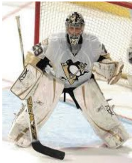
Fleury, Photo Curtosy of Google Images

Overall, the Penguins have a positive outlook on the season with a strong and aggressive offense and defense and depth with their goalies.