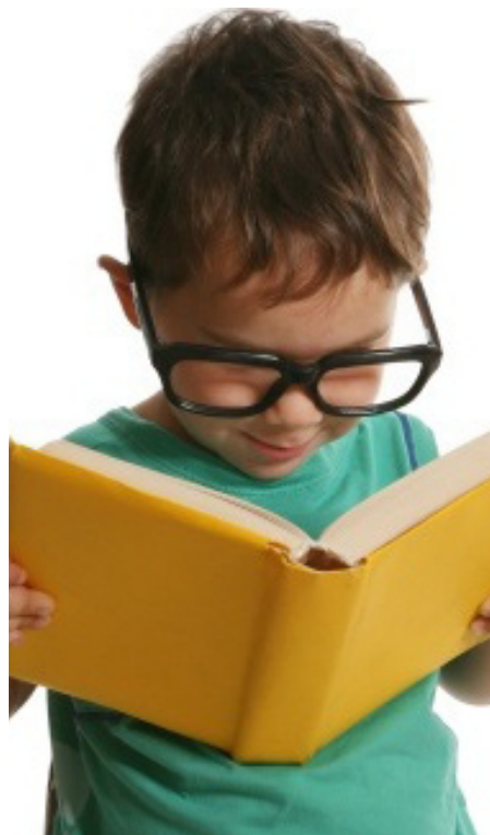
Kids who read understand emotions better.