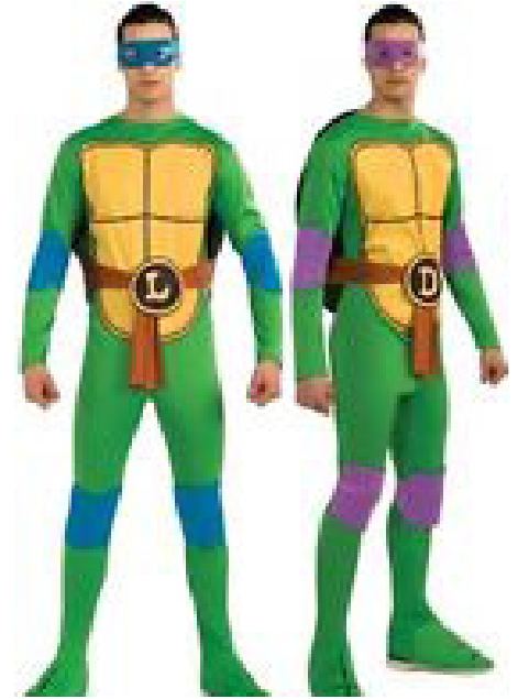
Teenage Mutant Ninja Turtles costumes