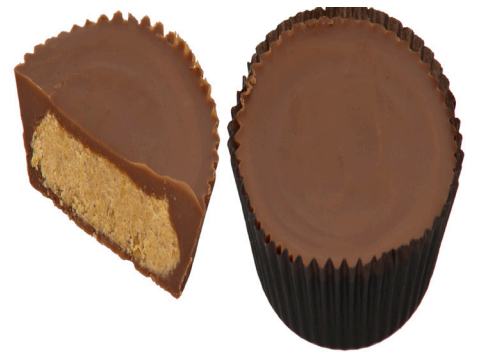
America's favorite Halloween candy, the Reese's Cup.

Halloween is rooted in the Irish holiday Samhein; however, our spooky holiday is practiced much differently. Samhein was believed to be the one day of the year where the veil between the worlds of the living and the dead were thinnest.