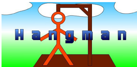
Hangman Game