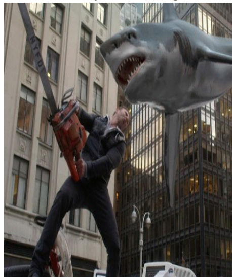
The main character of Sharknado preparing to slice a shark in half, with an oversized chainsaw.

Nothing is safe from the curse of the cheesy movie. Whether its bad concepts, bad editing, or ridiculous scenes, any movie can be affected. Even though they are bad, they often become "classics," and are watched over and over. Whether it be a tornado of sharks or a possessed serial killer doll, these movies will stick with you for a long time.