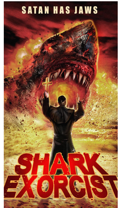
Shark Exorcist (2015)