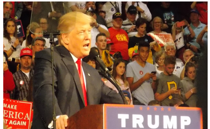
Trump at Ambridge High School by Alexa Burak

primarily Republican. In Obama's second election in 2012, all except Allegheny County, was Republican. But this year's election is different, as 36% of voters support Clinton and 31% support Trump. These are both close numbers but it looks like Clinton is going to win Pennsylvania with an estimated total of 44% over Trump's 41%.