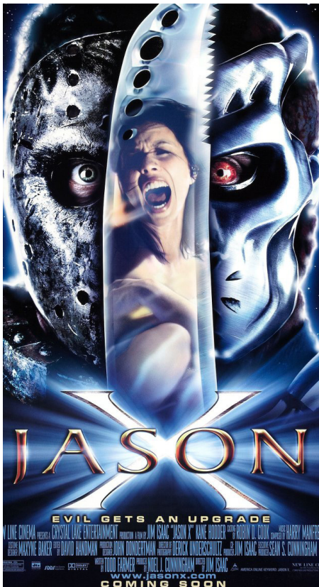
Jason X (2001)

Set in space, famed serial killer Jason Voorhees must pursue his victims across space stations in the tenth installment of the Friday the Thirteenth Series. By the time this movie happened, the series had exhausted itself. It's definitely the good sci-fi and horror cheese blend that finds its home in the early 2000s.