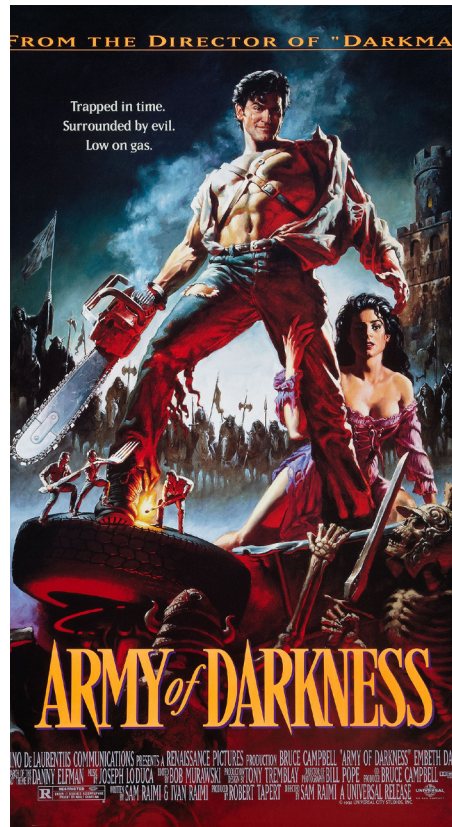
Army of Darkness (1992)